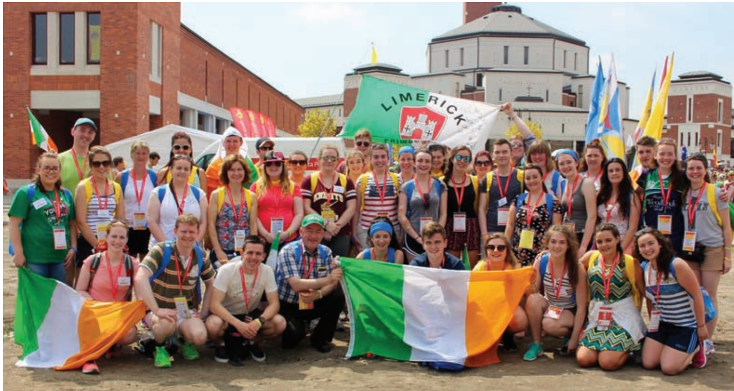
All photographs in this issue are from Word Youth Day 2016 in Poland and feature some of the 100 Limerick participants

The Bishop would also welcome any suggestions on how we can collectively ensure that children's welfare is promoted in all their Church related activities.