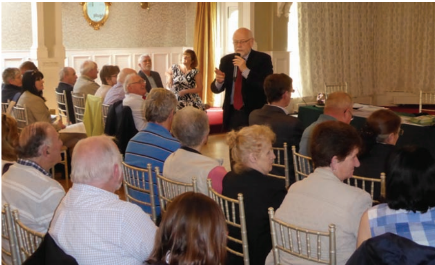
Safeguarding information meeting, Oct. 2015

The name of the parish safeguarding representative is displayed on a safeguarding poster at the main entrance of every church in the diocese